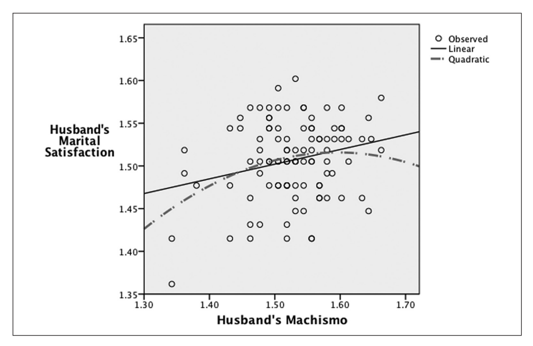
Figure 2. Scatterplot Depicting the Association Between Husbands' Overall Machismo (Total of Positive and Negative Machismo) and Their Own Marital Satisfaction

Note: Actor-Partner Interdependence Model (APIM) analyses of associations between machismo and relationship satisfaction were conducted using Structural Equation Modeling. Standardized betas ( \beta ) from APIM analyses are reported. **p < .01.